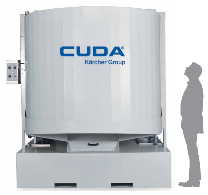
Approx. scale to 7272 model